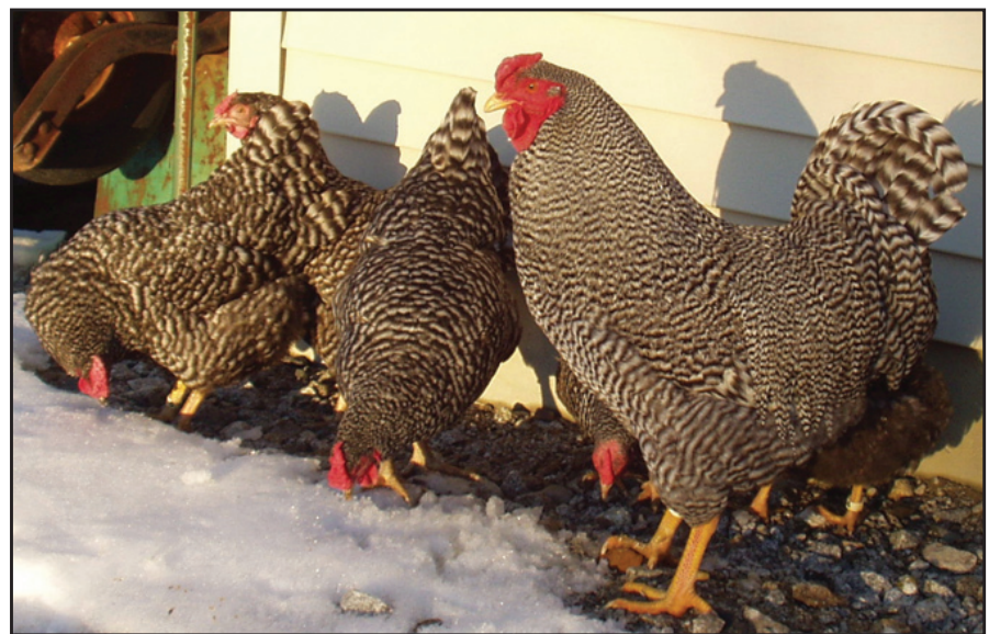
Dominique males average seven pounds and the females five pounds. The tightly arranged plumage protects the birds in cold weather, but they also adapt well to hot and humid climates.