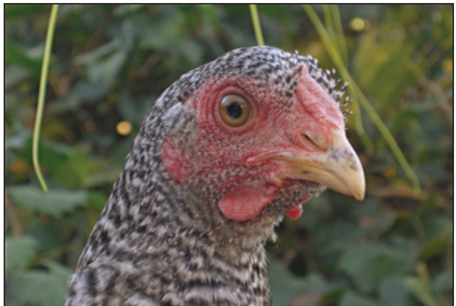
A promising Dominique pullet from Southern Oak Farm, spring 2007 hatch.

Barred chickens with both rose combs and single combs were somewhat common in the eastern United States as early as 1750. As interest in poultry