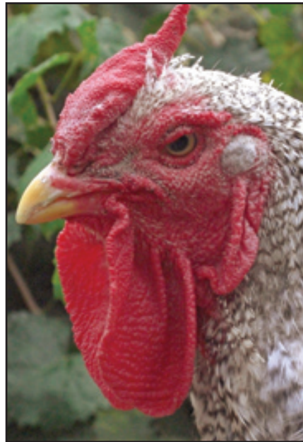
The low profile of the rose comb make this breed more resistant to frostbite than many other breeds

The Dominique is a medium-sized black and white barred (otherwise known as “cuckoo” patterned) bird. The barred plumage coloration is also referred to as hawk-colored and serves the Dominique in making the bird less